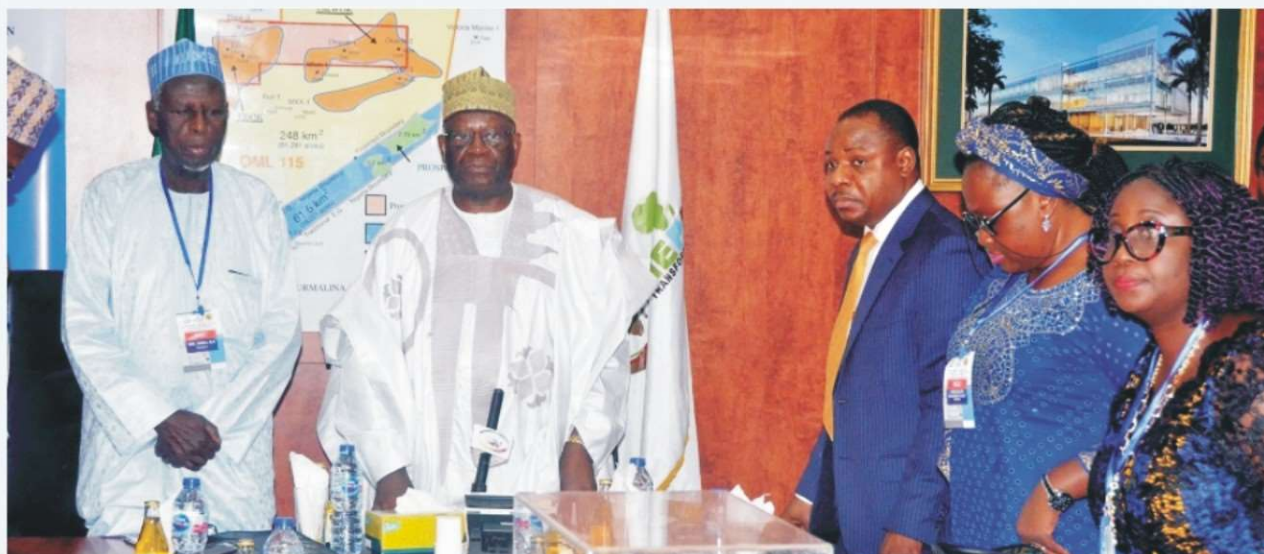
Top Officials pose for the Nigerian National Anthem during a session of the New Partnership for Africa's Development's African Peer Review Mechanism Governing Council.