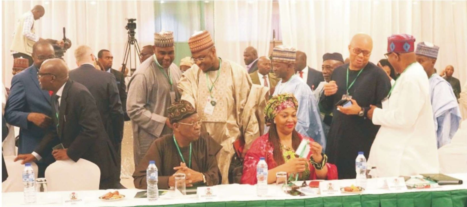
Some of the Ministers at the Two-day Presidential Retreat...