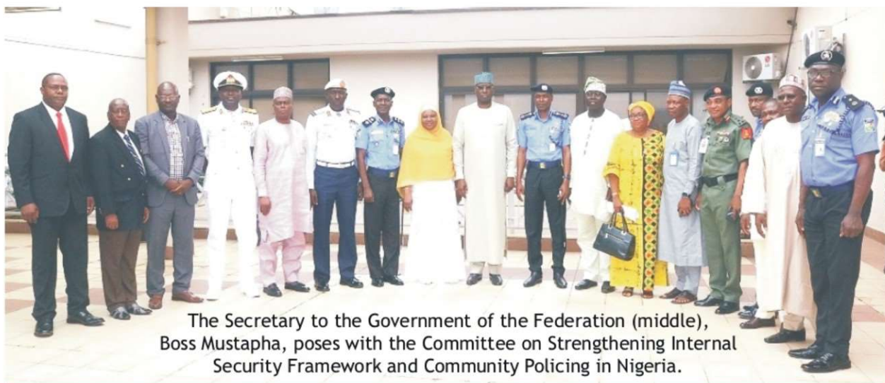
The Secretary to the Government of the Federation (middle), Boss Mustapha, poses with the Committee on Strengthening Internal Security Framework and Community Policing in Nigeria.

canvassed by many Nigerians, requires each state government to create, recruit, train, and manage a policing system separate from the federal system.