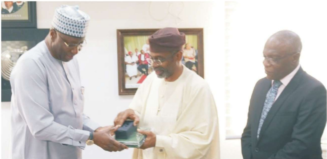
The Secretary to the Government of the Federation, Boss Mustapha, presents souvenir to the Honourable Speaker, Femi Gbajabiamila, while the Permanent Secretary, General Services Office looks on.