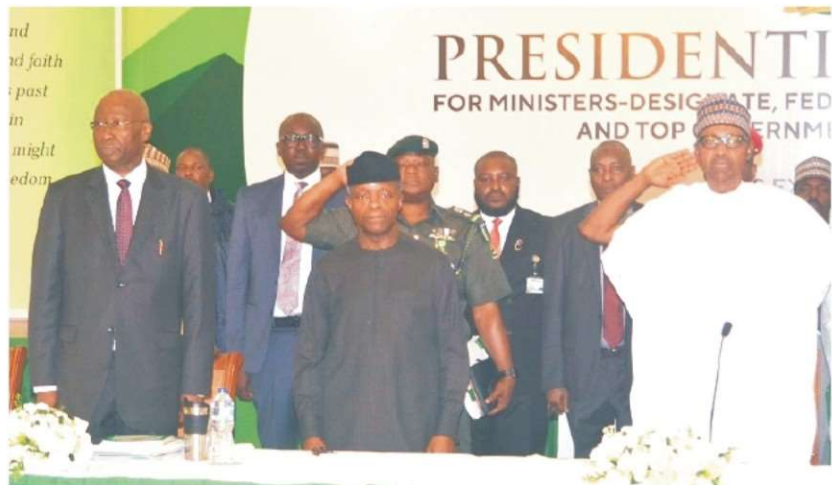
(R-L) His Excellency, President Muhammadu Buhari; Vice-President, Prof. Yemi Osinbajo and Secretary to the Government of the Federation, Boss Mustapha, at the Presidential Retreat for Minister-Designate, Federal Permanent Secretaries and Top Government functionaries.

He gave the ministers a schedule of duties, including the development and implementation of policies, programmes and projects in their various Ministries, Departments and Agencies in line with Government priorities. He advised them to ensure that agencies under them are effective, efficient and accountable in the discharge of their responsibilities. He also