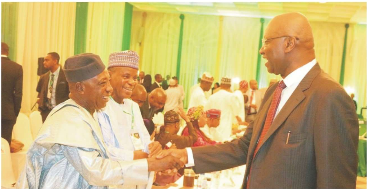
The Secretary to the Government of the Federation, Boss Mustapha, congratulates Ministers during a Two-day retreat for the incoming Ministers and other top government functionaries.