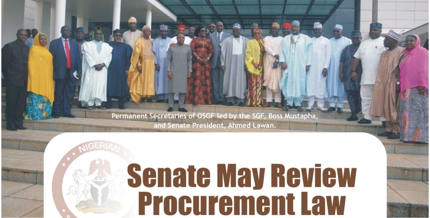
Permanent Secretaries of OSGF led by the SGF, Boss Mustapha, and Senate President, Ahmed Lawan.