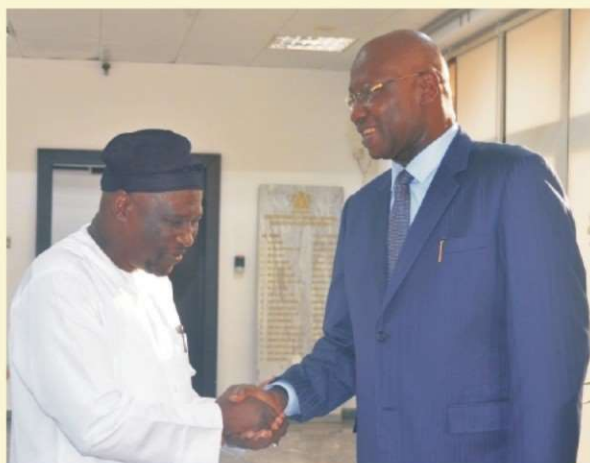
The Secretary to the Government of the Federation, Boss Mustapha, in a handshake with the Governor of Adamawa State, Ahmadu Fintiri during a courtesy visit to his office.