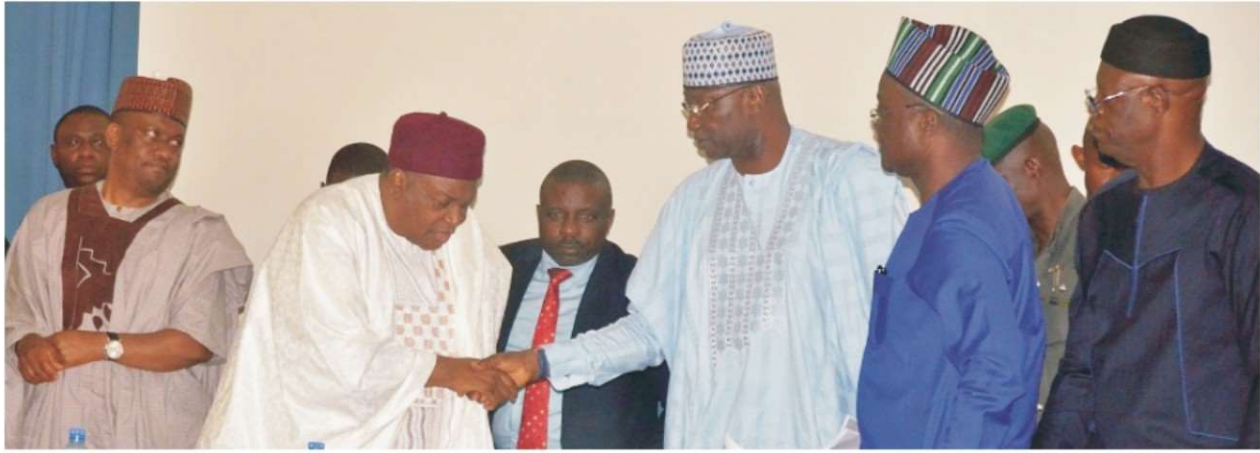
The Secretary to the Government of the Federation, Boss Mustapha, in a handshake with Taraba State Governor, Arc. Darius Dickson (Second left), while Benue State Governor, Samuel Otom and his Deputy, Benson Abounu look on.