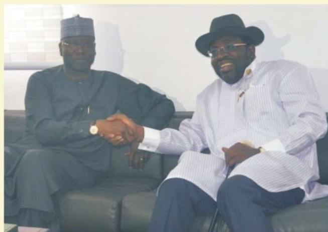
The Secretary to the Government of the Federation, Boss Mustapha, poses with the Executive Governor of Bayelsa State, Henry Seriake Dickson, during a courtesy visit to his office.