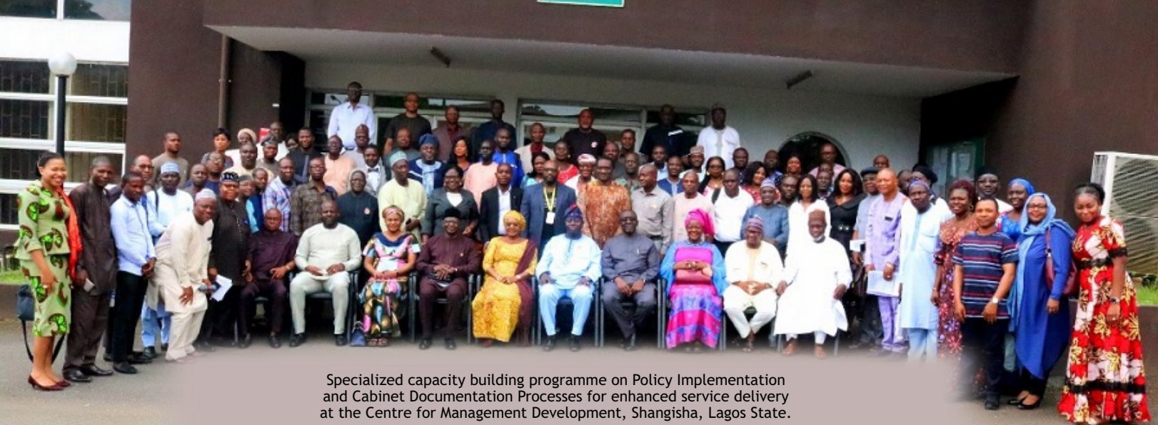
Specialized capacity building programme on Policy Implementation and Cabinet Documentation Processes for enhanced service delivery at the Centre for Management Development, Shangisha, Lagos State.