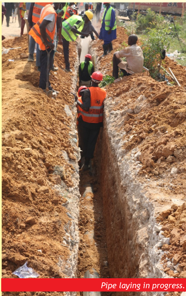
Pipe laying in progress.