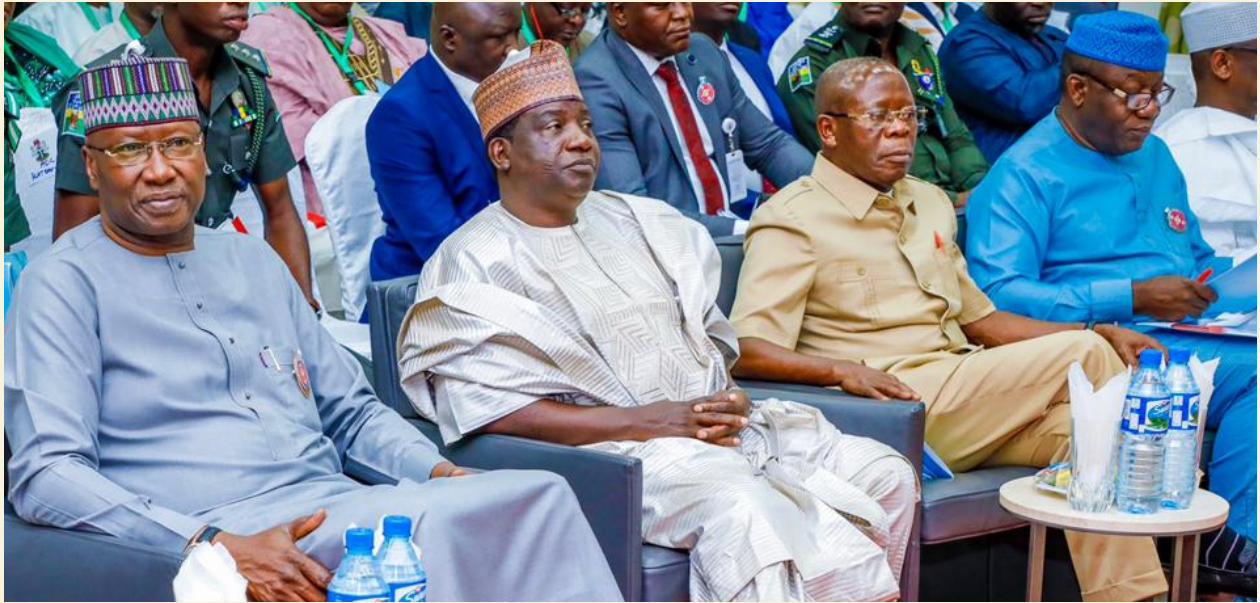
(L-R) The Secretary to the Government of the Federation, Boss Mustapha; Chairman of Northern Governor's Forum, Rt Hon. Barr Simon Bako Lalong; National Chairman of the All Progressives Congress, Comrade Adams Oshiomhole; Chairman of the Governor's forum and Governor of Ekiti, Dr. Kayode Fayemi at 3rd FG & Progressive Governors' Parley on Policy Synergy in Jos, Plateau State.