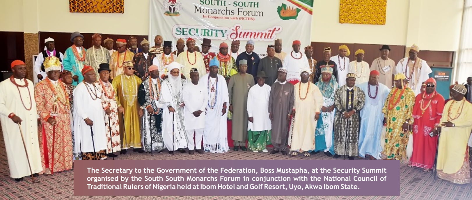
The Secretary to the Government of the Federation, Boss Mustapha, at the Security Summit organised by the South South Monarchs Forum in conjunction with the National Council of Traditional Rulers of Nigeria held at Ibom Hotel and Golf Resort, Uyo, Akwa Ibom State.