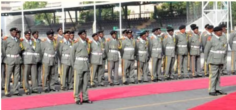
Cross section of legionnaires at the event.

I n honour of the Nigerian war veterans who have dutifully served the country, the Secretary to the Government of the Federation, Mr. Boss Mustapha, has assured retired soldiers of the Federal Government's support of their welfare.