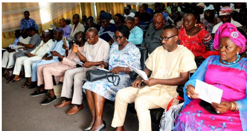
Participants at the 3-day training of MDAs officials and CAO Relationship Officers.

He said the retreat was good and helpful as it would expose beneficiaries to learn something new, build new networks, observe new processes and bring up new resolutions on how to make difference at work.