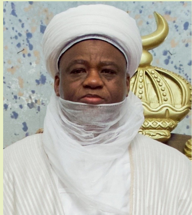
● Sultan of Sokoto, Alhaji Muhammad Sa'ad Abubakar III

Gowon who is the conveyer of 'Nigeria Prays' was confident that the nation can overcome its various