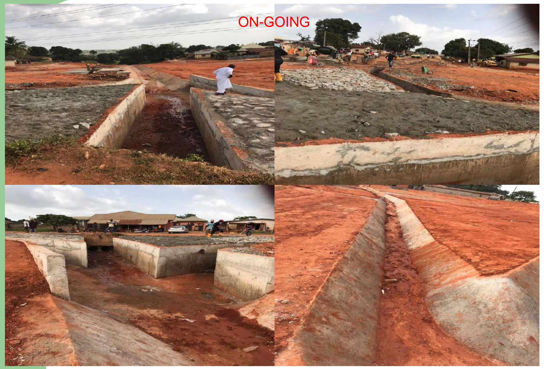
Above represents sample of parts of the on-going work at the site