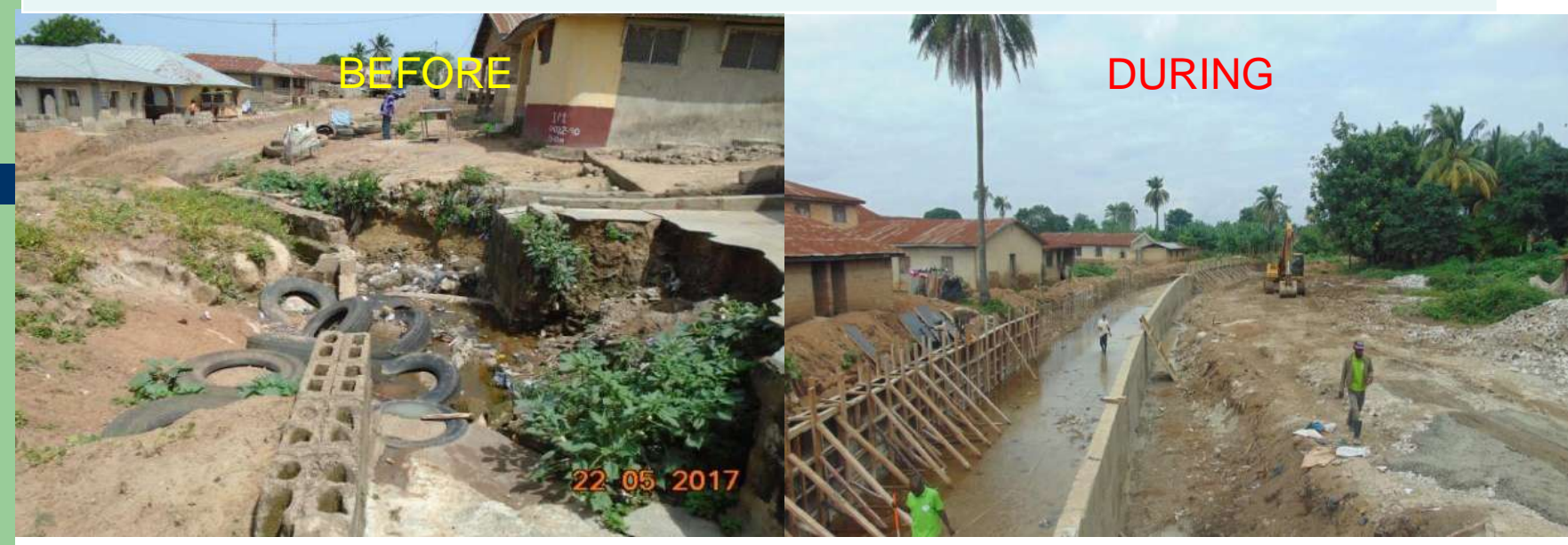
Above represents sample of parts of the ecological site before the commencement of work