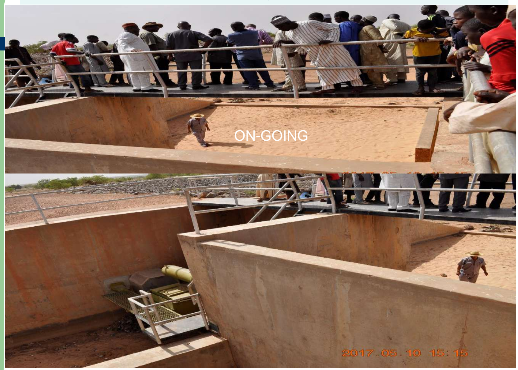
Above represents sample of parts of the on-going work at the site