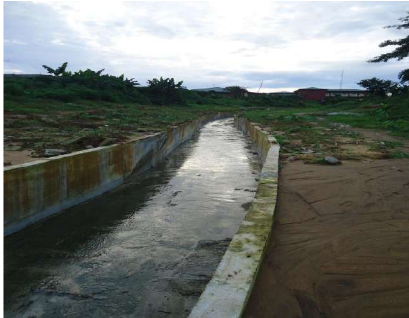
Above represents sample of parts of completed work