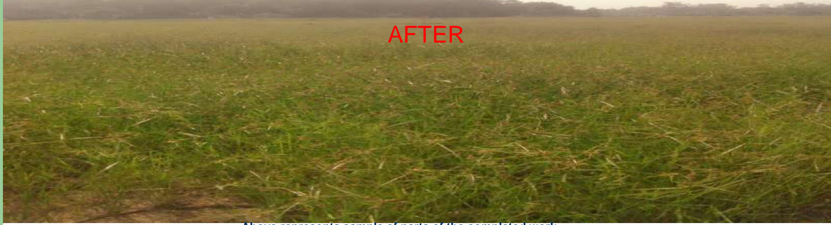
Above represents sample of parts of the on-going work at the site