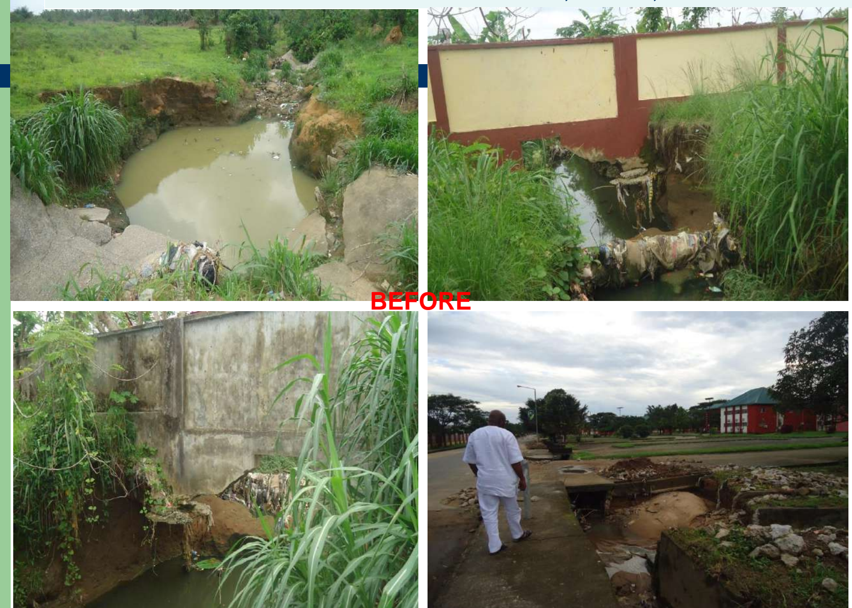
Above represents sample of parts of the ecological site before the commencement of work

UNIVERSITY OF CALABAR EROSION & FLOOD CONTROL WORKS, CALABAR, CROSS RIVER STATE