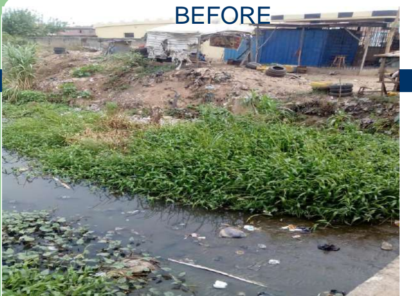
Above represents sample of parts of the ecological sites before commencement of work