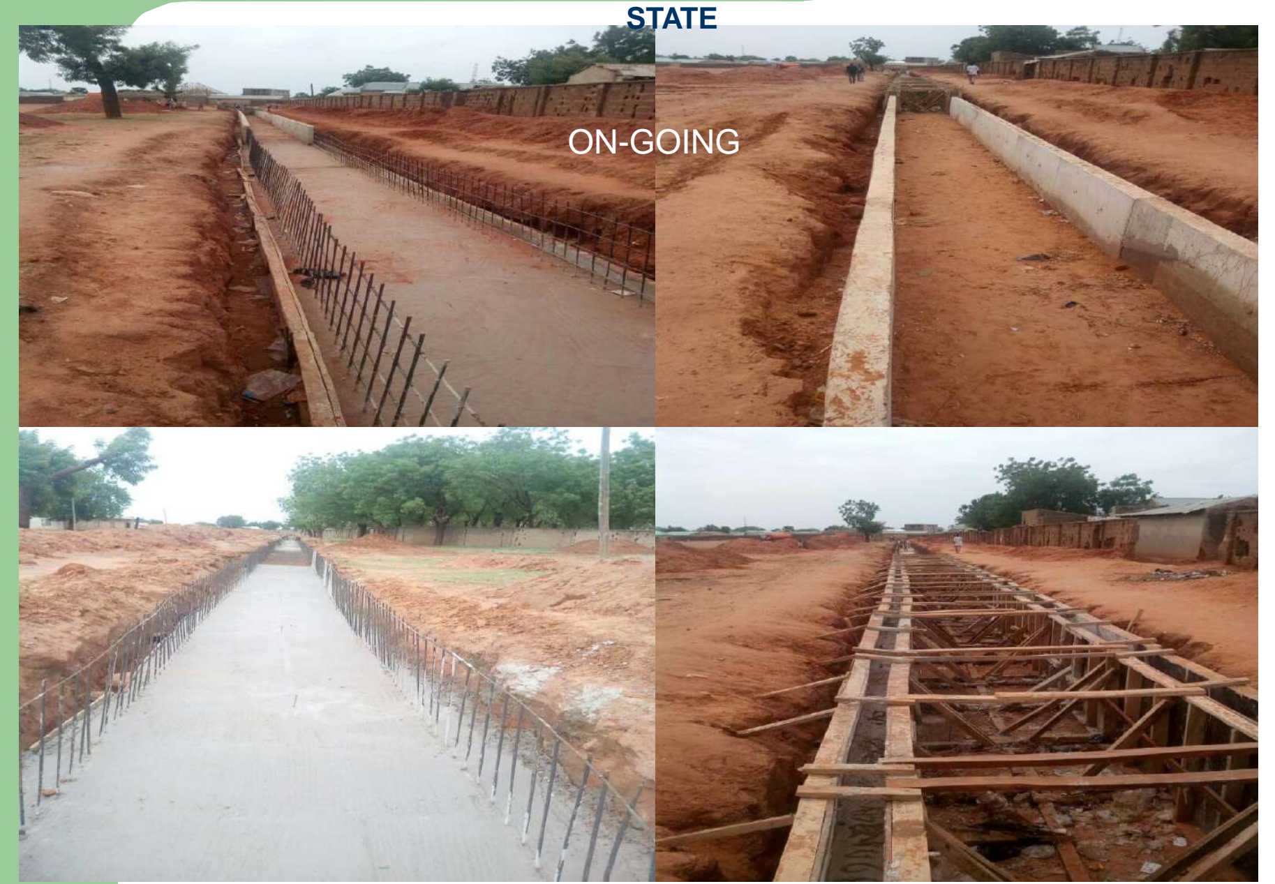
Above represents sample of parts of the on-going work at the site