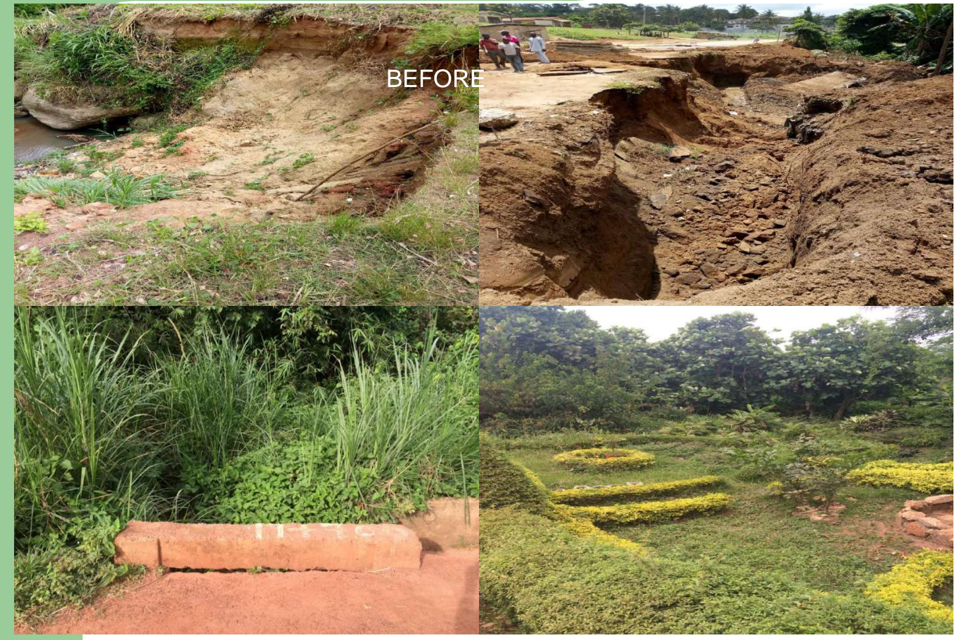
Above represents sample of parts of the ecological site before the commencement of work