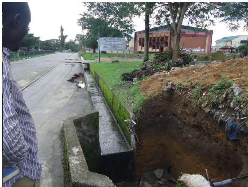
Above represents sample of parts of the on-going work at site