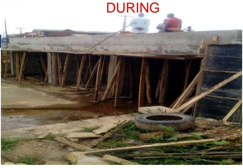
Above represents sample of parts of the on-going work at the site