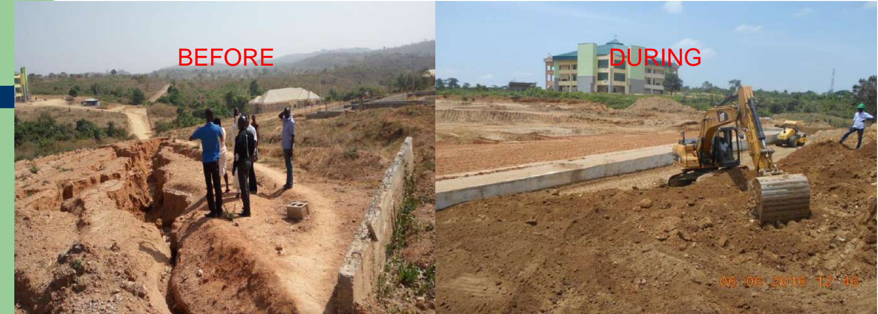
Above represents sample of parts of the ecological site before the commencement of work