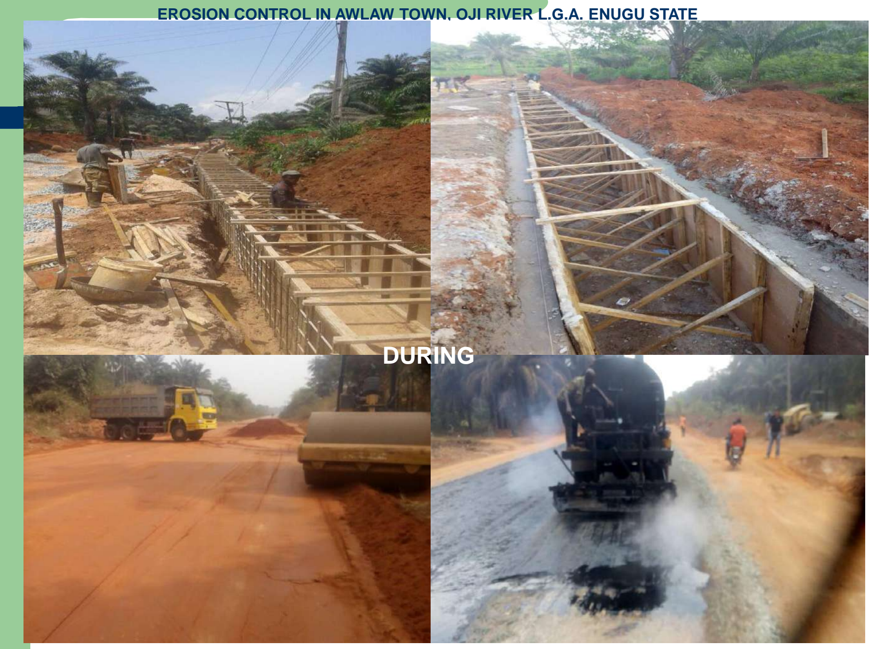
Above represents sample of parts of the on-going work at the site