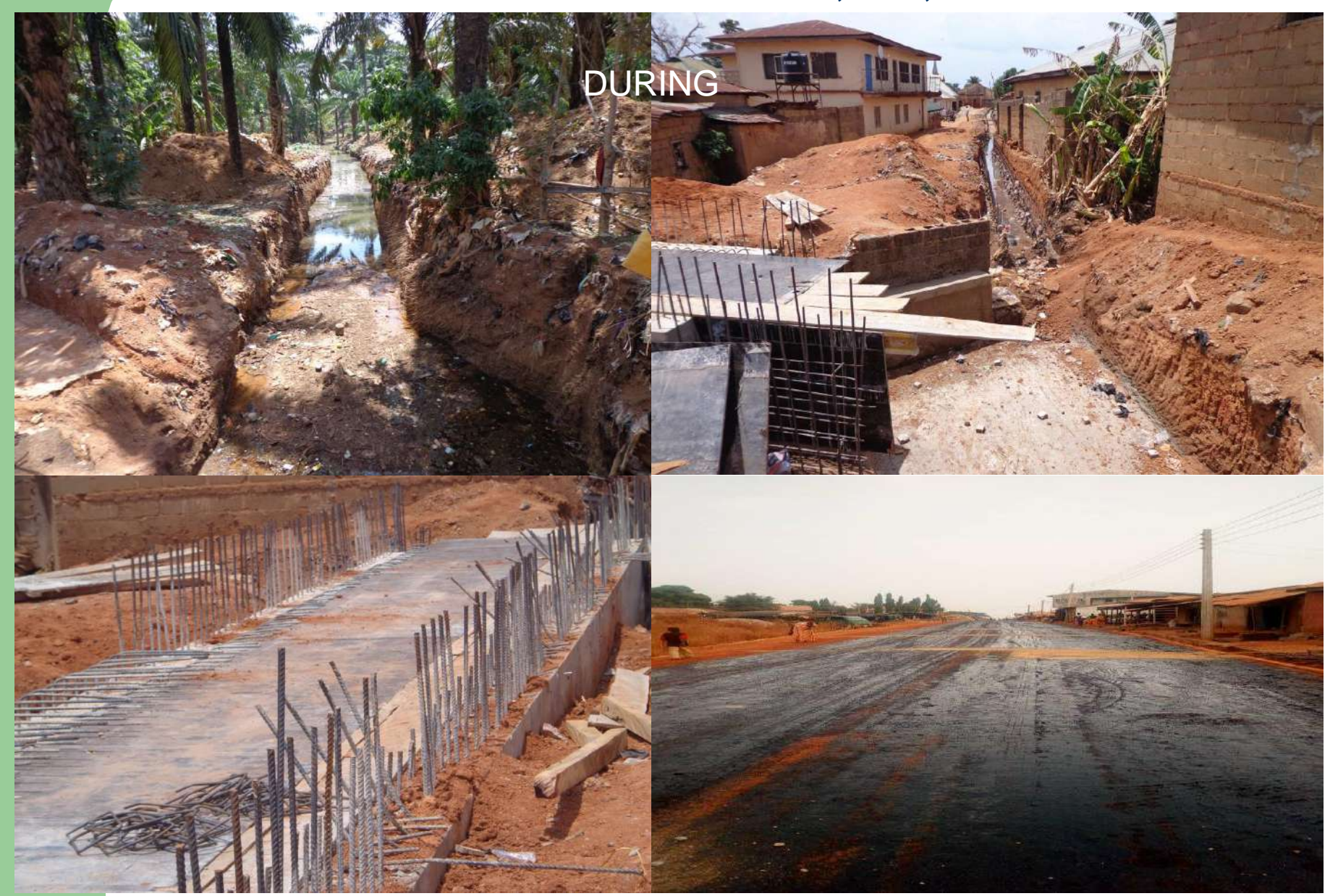
Above represents sample of parts of the on-going work at the site