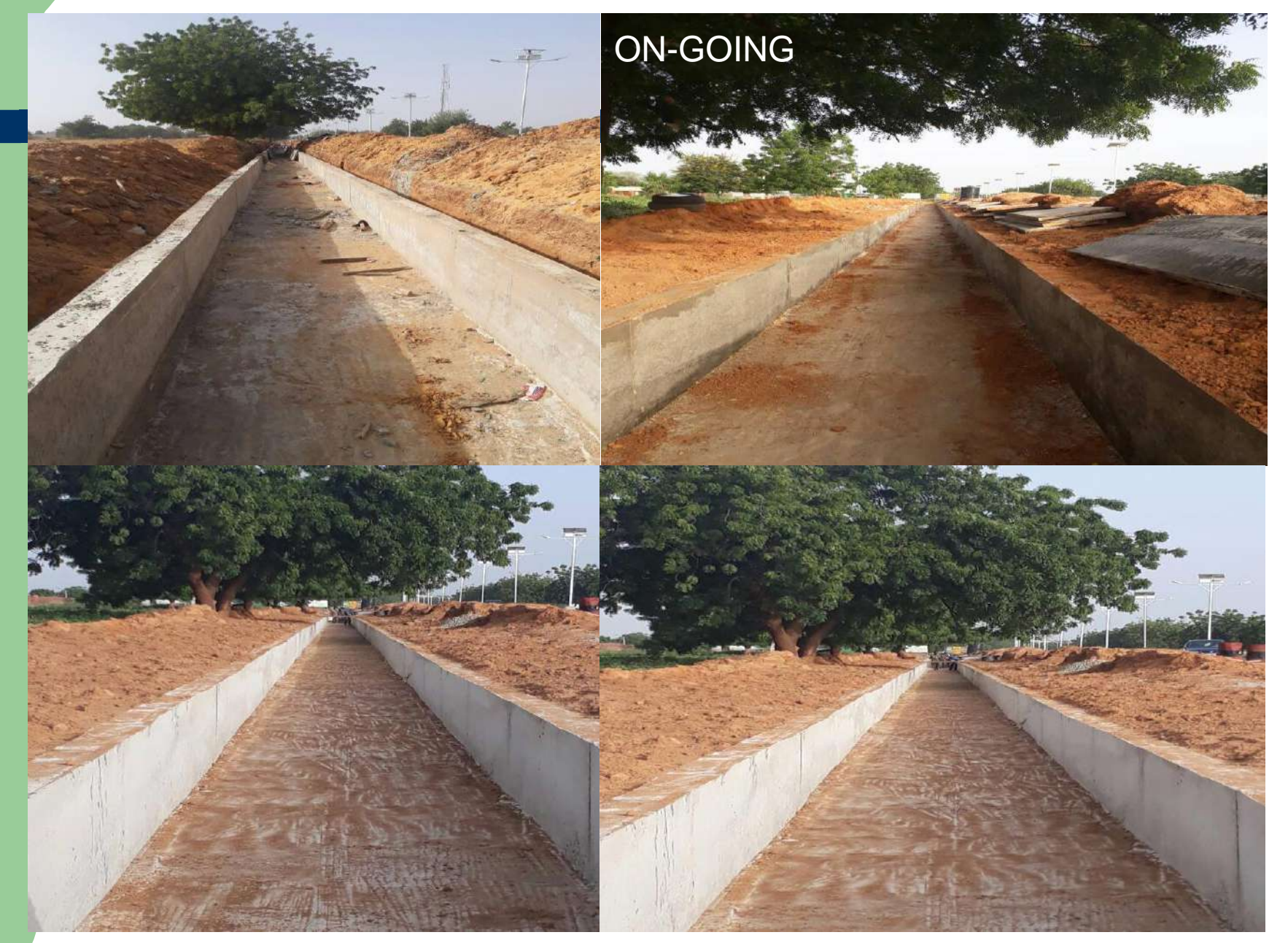
Above represents sample of parts of the on-going work at the site