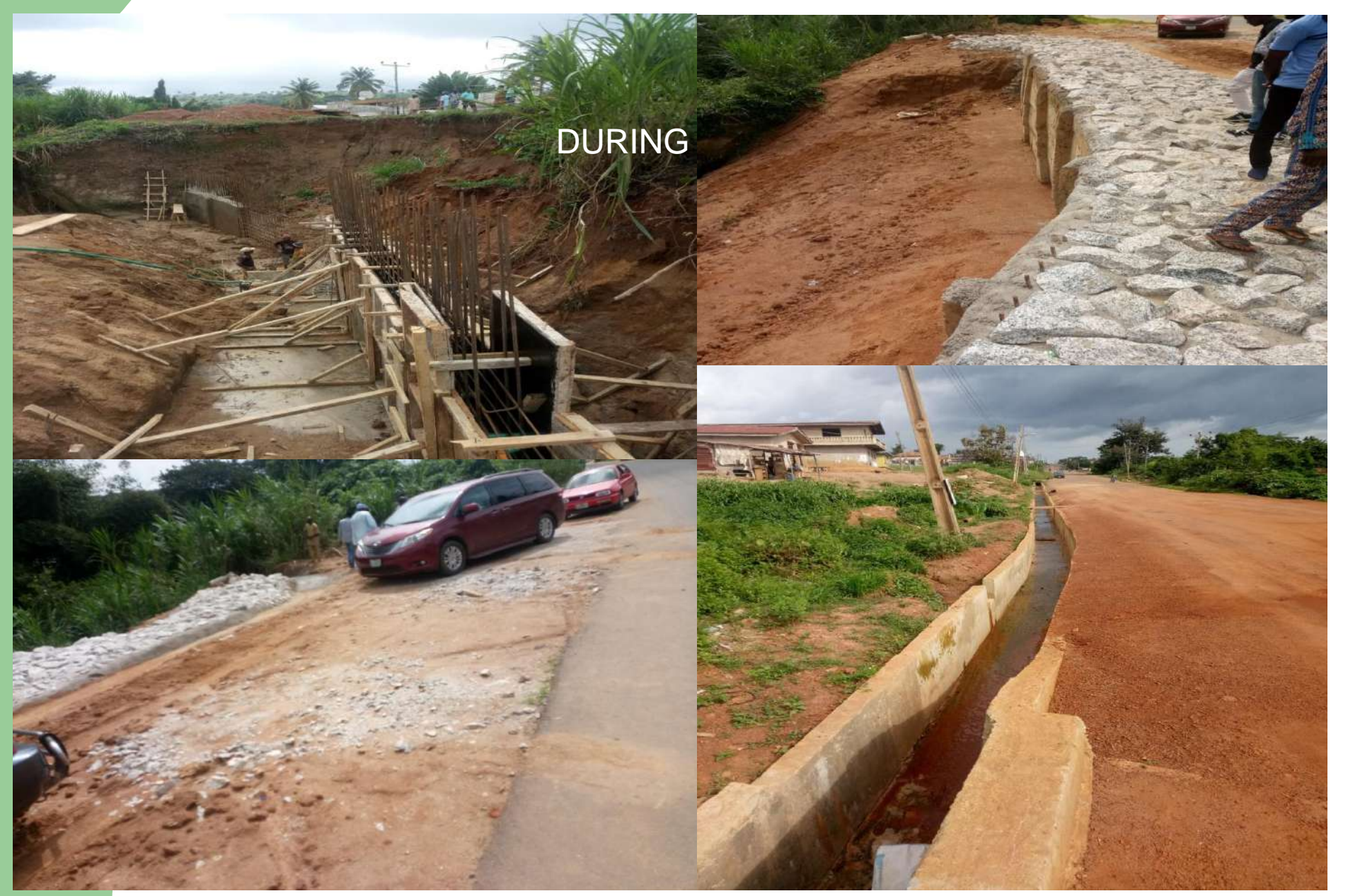
Above represents sample of parts of the on-going work at the site