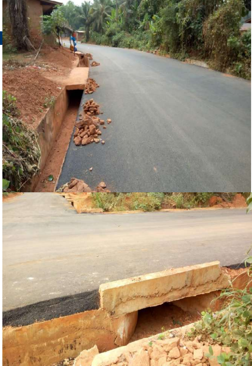
Above represents sample of parts of the completed work