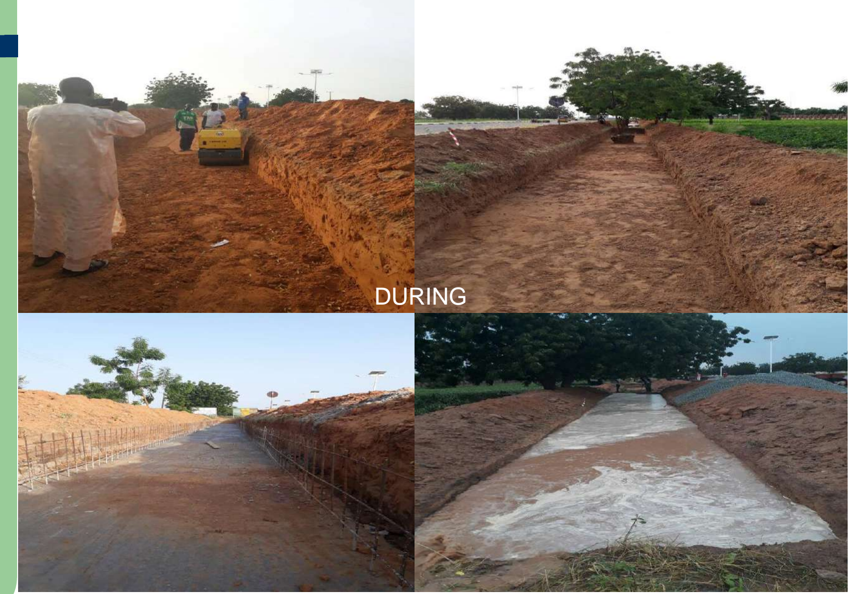
Above represents sample of parts of the on-going work at the site